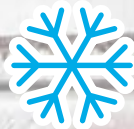
Model RTDF chillers